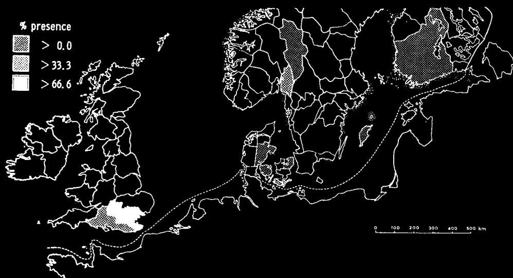
FIG. 3. Distribution Type B.