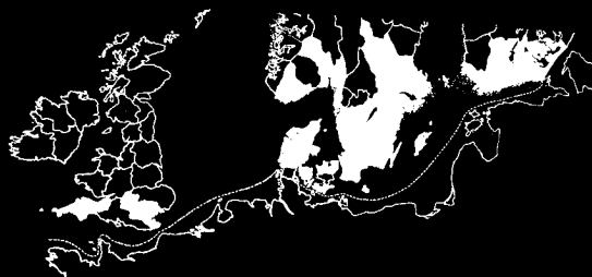
FIG. 43. Formica rufibarbis Fabricius