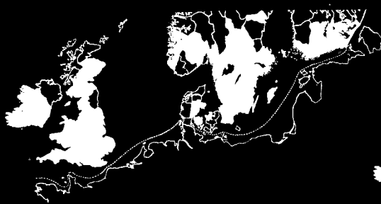
FIG. 39. Lasius mixtus (Nylander).