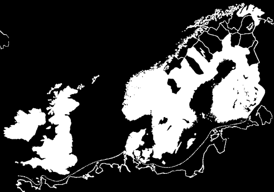
FIG. 42. Lasius flavus (Fabricius).