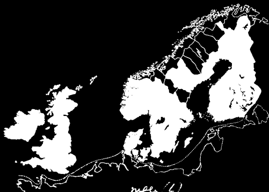
FIG. 40. Lasius fuliginosus (Latreille).