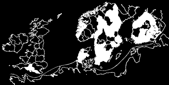
FIG. 44. Formica pratensis Retzius.

ly related to the relatively higher number of species recorded there than from immediately adjacent area units through its geographical situation, sheltered from exposure to western gales and the more intense summer linking it with more southern areas of Scandinavia. For example, Lasius flavus , M. rubra and Formicoxenus nitidulus are recorded from Northeast Finnmark but not from adjacent areas