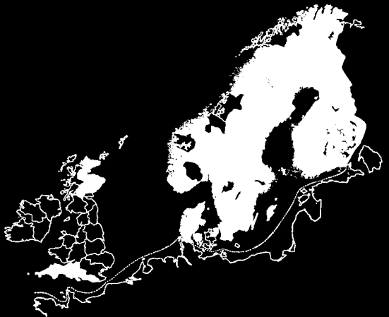
FIG. 49. Formica exsecta Nylander.

while F. sanguinea occurs throughout Finland but is rare or unrecorded from Northwest Norway.