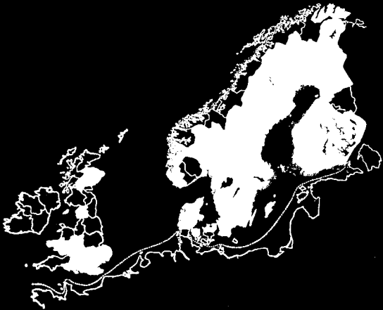
FIG. 47. Formica sanguinea Latreille.