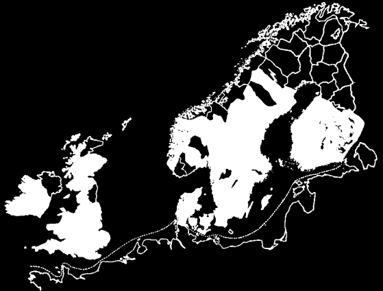
FIG. 48. Formica fusca Linnaeus.