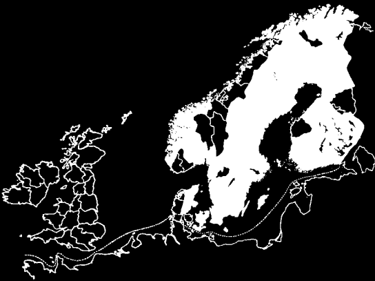
FIG. 46. Formica truncorum Fabricius.