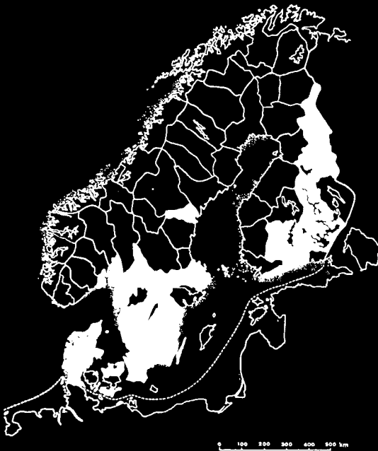
FIG. 54. Formica pressilabris Nylander.