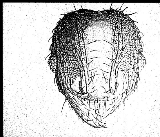
Fig. 8 Pheidole rugosula minor, head ( \times 88 ).