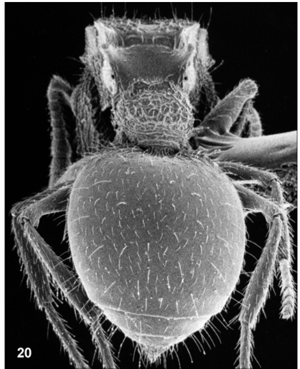
Figs. 19 - 20: Meranoplus dimidiatus , worker, see text for details.