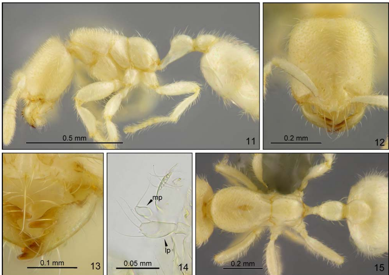
Figs. 11 - 15: Anillomyrma tridens BOLTON, 1987, paratype worker. (11) Body in lateral view; (12) head in full-face view; (13) mandible in full-face view; (14) mouthparts in ventral view: maxillary palp (mp), labial palp (lp); (15) body in dorsal view.

hairs. Head in full-face view roughly rectangular, longer than broad; mandible with three large sharp teeth. Apical and preapical teeth close together, separated by a diastema from 3 rd tooth; 3 rd much larger than 2 nd ; antennal scape short, reaching only 7 / 10 - 3 / 4 of distance from anterior margin of clypeus to posterior margin of head; apical antennal segment more than 3 times as long as preapical segment. Dorsum of mesosoma in lateral view flat. Dorsum and posterior slope of propodeum in lateral view forming rounded outline. Petiolar peduncle in lateral view relatively slender (as in Fig. 11).