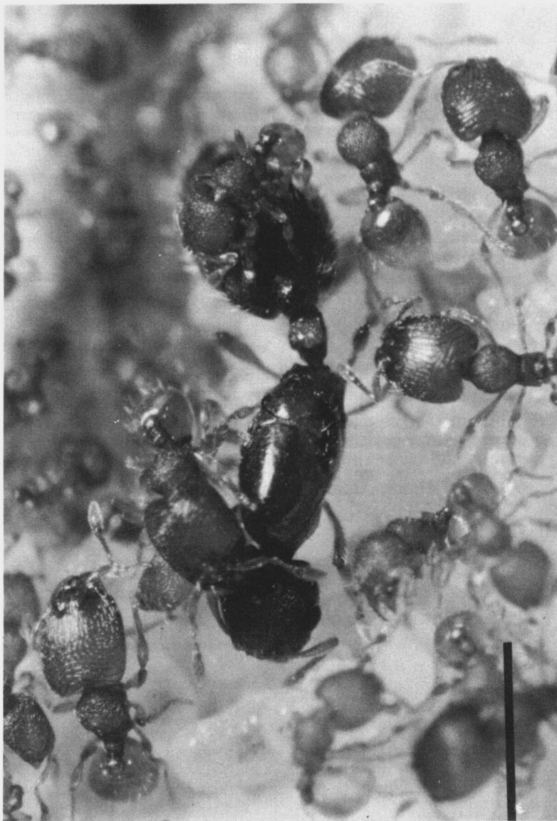
Fig. 1. Portion of Oligomyrmex overbecki study colony, showing the queen (center), minor and major workers, and brood. Scale bar = 1.0 mm.