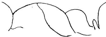
Profile of thorax of Iridomyrmex obscurus , sp. n.

Clypeus, front, occiput, pronotum, node, and base of gaster with groups of stiff hairs; tibiæ with exserted hairs, antennæ with none. Whole body covered with a fine cinereous pubescence.